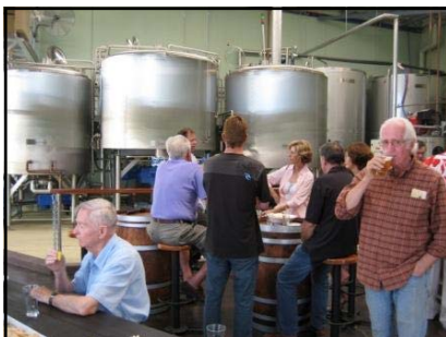
Members & friends at the Brewery.

We need a minimum of 10 people to attend the games in order to get discount tickets. The cost is $45.00 for members and $48.00 for non members for Gold seating at Skilled Park. Please ring me if you want to go as we will need to purchase tickets as soon as they are available. Georgia on 55808977.