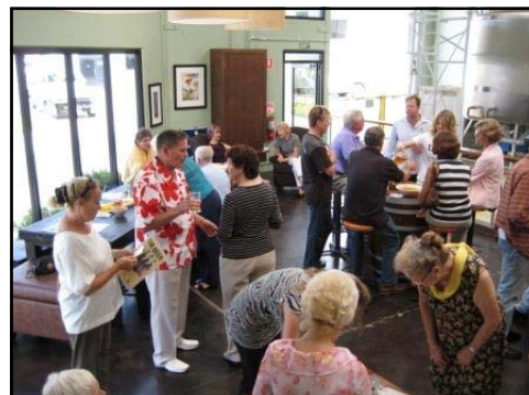
7 Members enjoying the Duke Brewery Tour