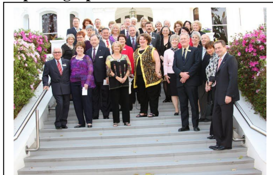
Conference members on steps of Government House prior to the Governor's Reception.