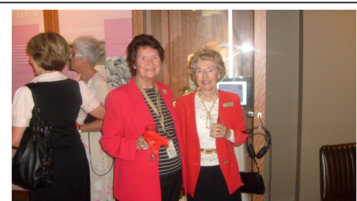
Kit and Anne found the McArthur Museum very interesting over drinks.

Please use the booking sheet on the last page for the next two major functions.