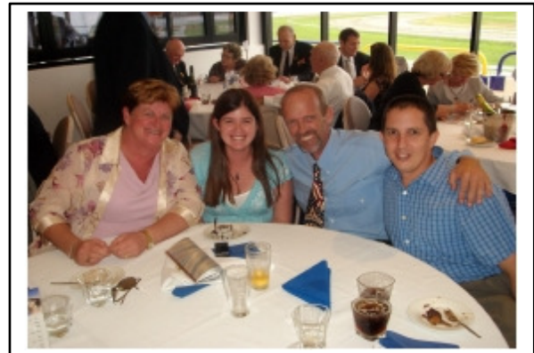
Members and friends enjoying the Race Day Luncheon!