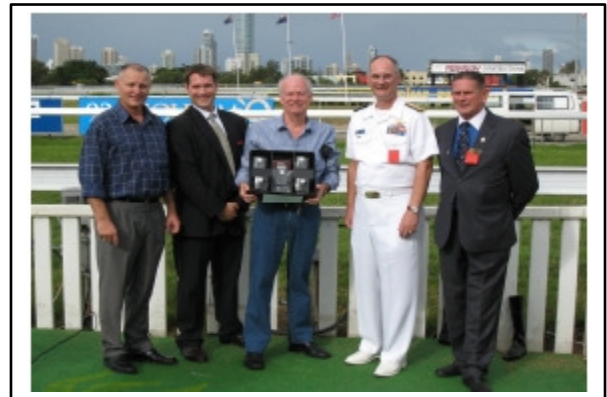
The trainer of the winning horse in the Battle of the Coral Sea Race 2010, holds the trophy proudly. Who will win this year?