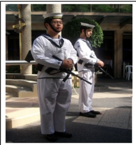
Two of the mounted Catafalque Party last year.